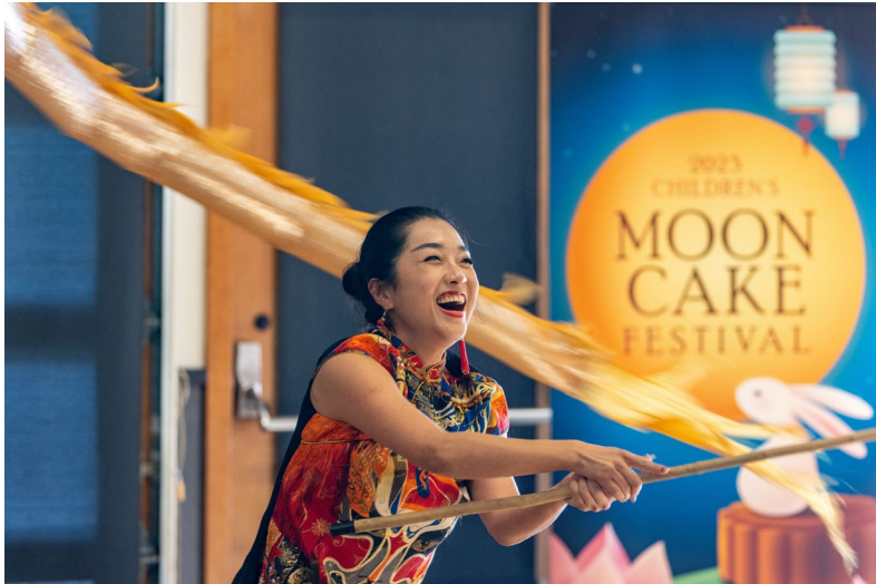
Renton celebrated its first Mooncake Festival at Renton Community Center.

Thank you for being part of the solution and helping Renton stay safe, clean, and welcoming to those that live here and visit.